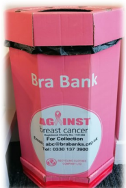
Bra Bank in the lobby